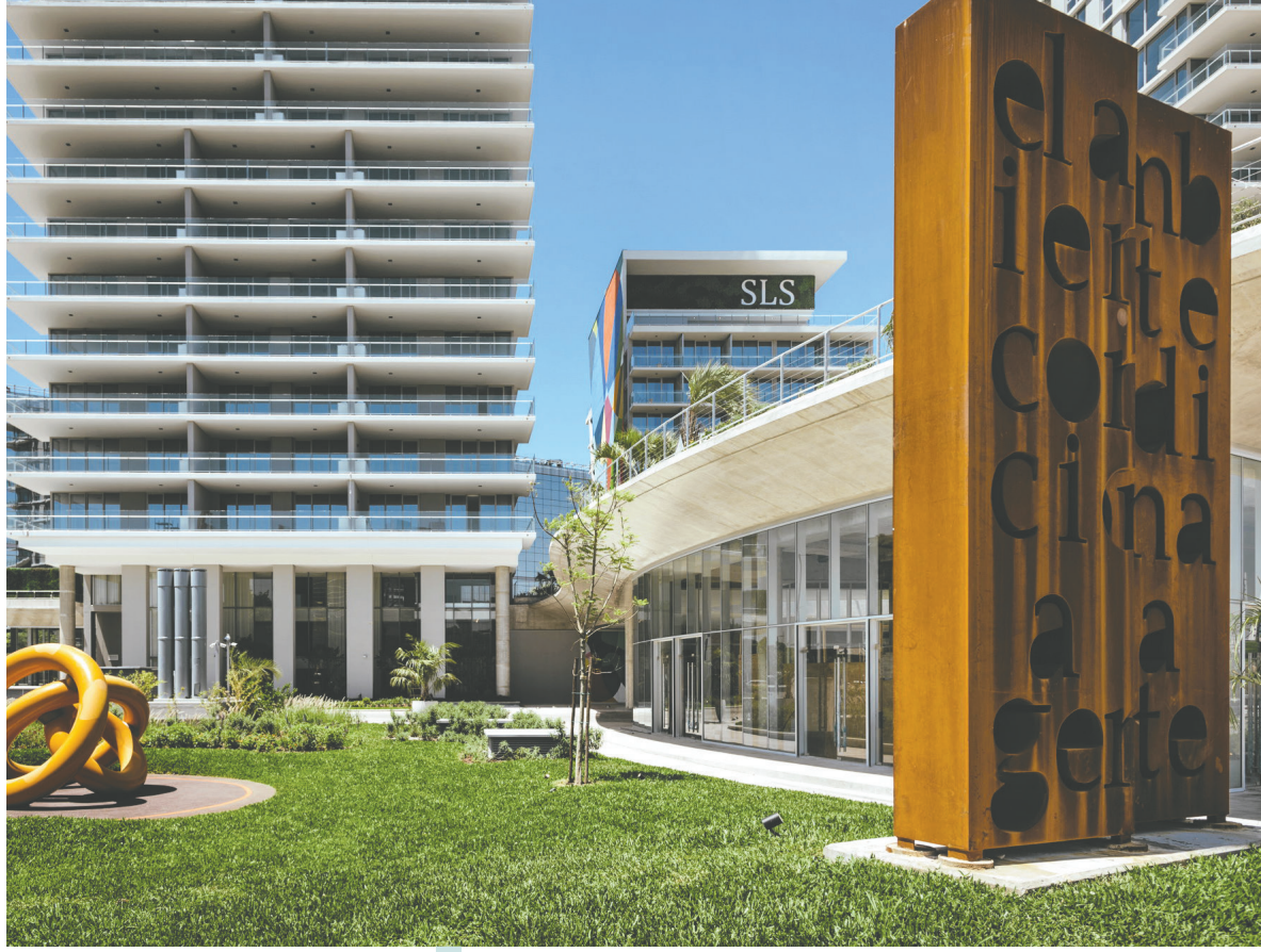
SLS Puerto Madero in Buenos Aires is a full-service hotel with a chic boutique look and dramatic artworks. SLS PUERTO MADERO

SLS Puerto plans to keep pace. Spring kicks off in September with parties and music around the pool and Leynia's terrace. To amplify the buzz exponentially,